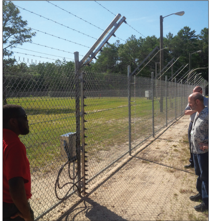
Members of Huntsville Center's Electronic Security Systems - Mandatory Center of Expertise participate in a technology demonstration at a DOD test site.

Policy Basis: The ESS-MCX is firmly grounded in both Army policy and USACE policy. AR 190-13, The Army Physical Security Program, tasks the commanding general, U.S. Army Corps of Engineers, to maintain the Electronic Security Center as a mandatory center of expertise for electronic security systems technical expertise to U.S. Army organizations. ER 1110-1-8162, Design and Construction Policy for Electronic Security Systems, specifies services to be performed by the ESS-MCX and describes operating and reporting procedures.