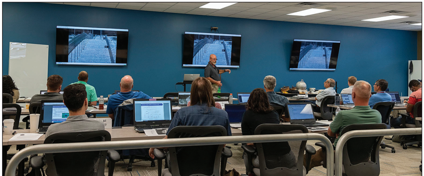
Pictured is the ESS Design Course in June 2022.

The ESS-MCX provides technical support services to the Army.